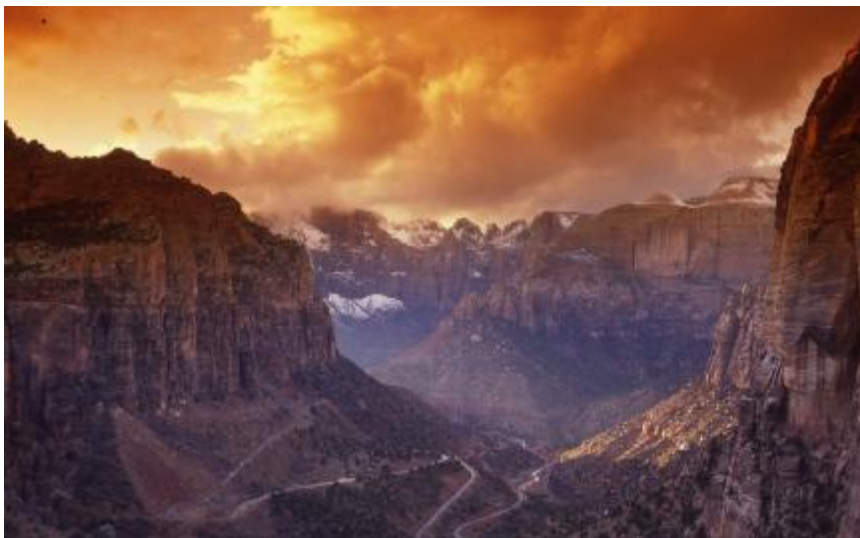
Zion National Park overlook

We are the rally leaders and are both staying at the Casablanca Resort.